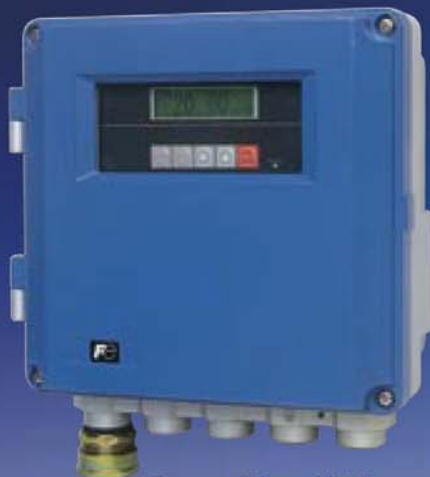
Transmitter <IP67> (Type: ZKM2)

The transmitter is available in two case structures: IP66 and IP67.