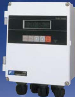
Transmitter <IP66> (Type: ZKM1)