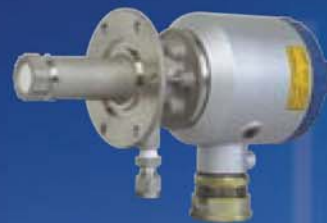
Zirconia oxygen detector (Type: ZFK8)