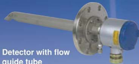
Detector with flow guide tube